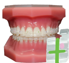
Nova S+ (Sapphire)