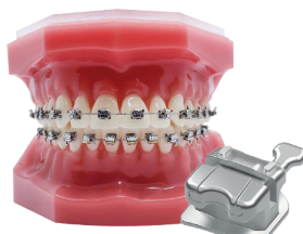
Nustar Gen 2 SLB